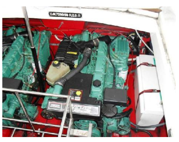
Engines KAD 42s