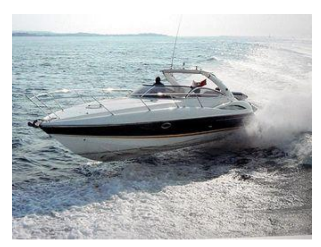
Manufacturer provided image