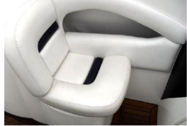
Shaken Not Stirred