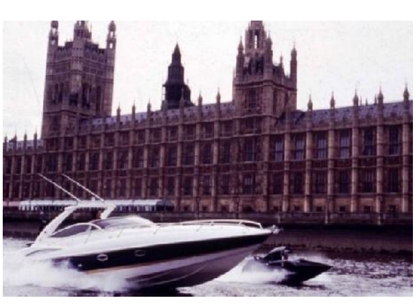
Sunseeker Superhawk 34