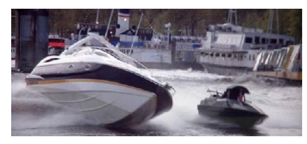
The chase from the "World is Not Enough"