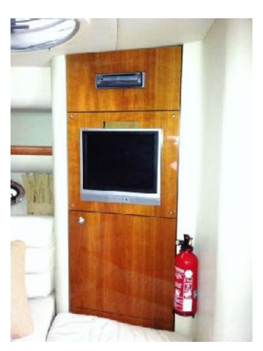
Flat screen TV