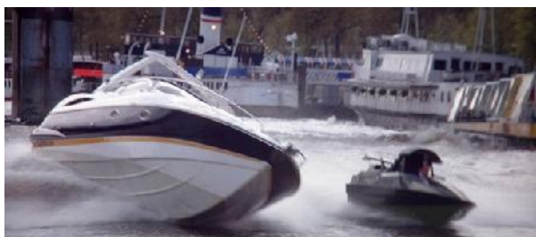
The chase from the "World is Not Enough"