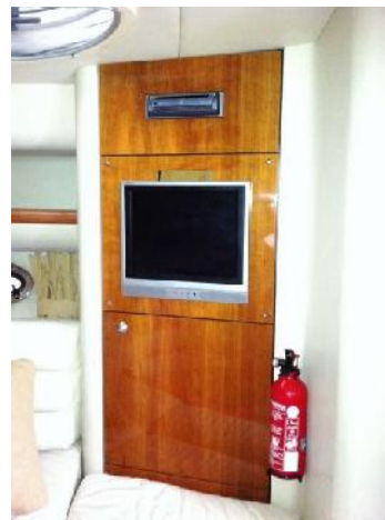
Flat screen TV