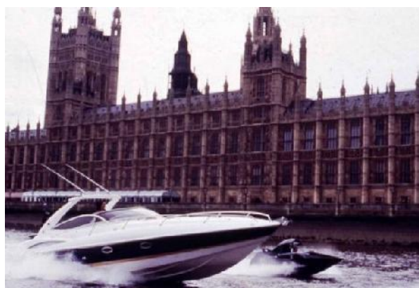
Sunseeker Superhawk 34