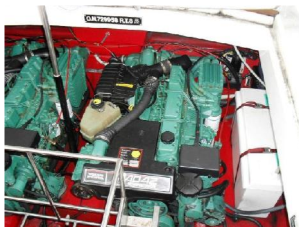
Engines KAD 42s