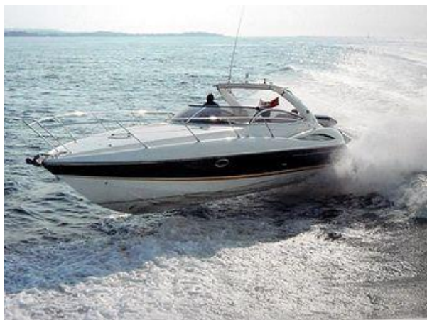
Manufacturer provided image