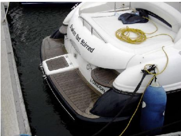
Shaken Not Stirred